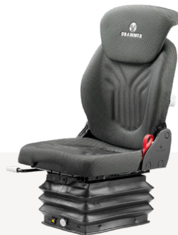
Cushion width of 400 mm