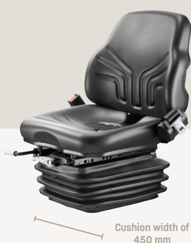
COMPACTO® BASIC Modell XM