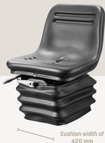
COMPACTO® BASIC Modell XS