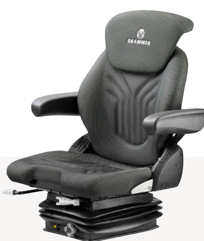
Cushion width of 450 mm