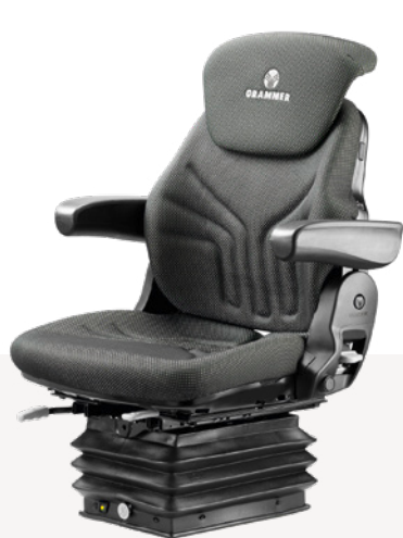
Cushion width of 480 mm

Your COMPACTO® COMFORT is available in different seat tops, cushion widths and extra features, so you can match it perfectly to your vehicle – no matter how small or narrow its cabin is.