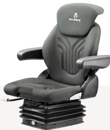
Cushion width of 450 mm