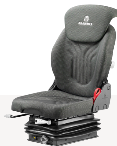
Cushion width of 400 mm