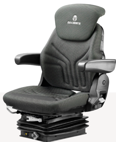
Cushion width of 480 mm

The COMPACTO® BASIC models feature mechanical suspension but adapt just as individually to your comfort requirements as the COMFORT versions. Three different seat heights can be set via an easy-to-turn knob. While sitting, the user then operates a lever at the front to align the seat's weight with the selected height in an easy-to-read display. This ensures that your COMPACTO® BASIC always provides you with sufficient suspension stroke.