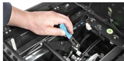
A spring circlip tool being used on a seat