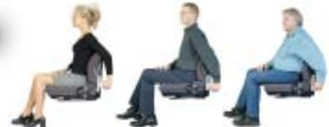
Illustration may deviate from series.